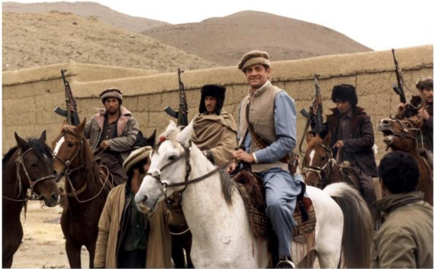
Charlie Wilson, US House of Representative (1973-1997)